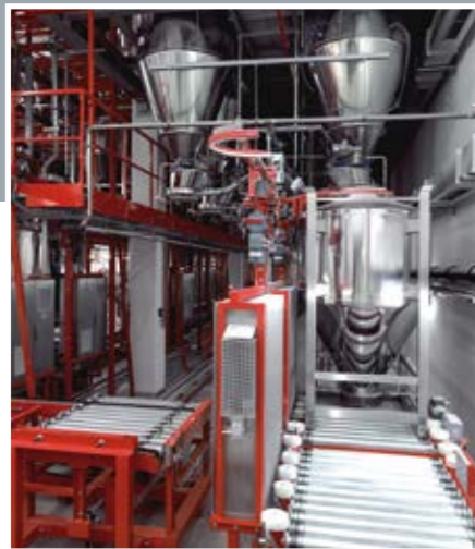
Container filling with KAD – KOKEISL