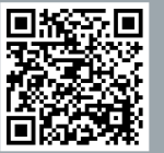
Continuous cookie production