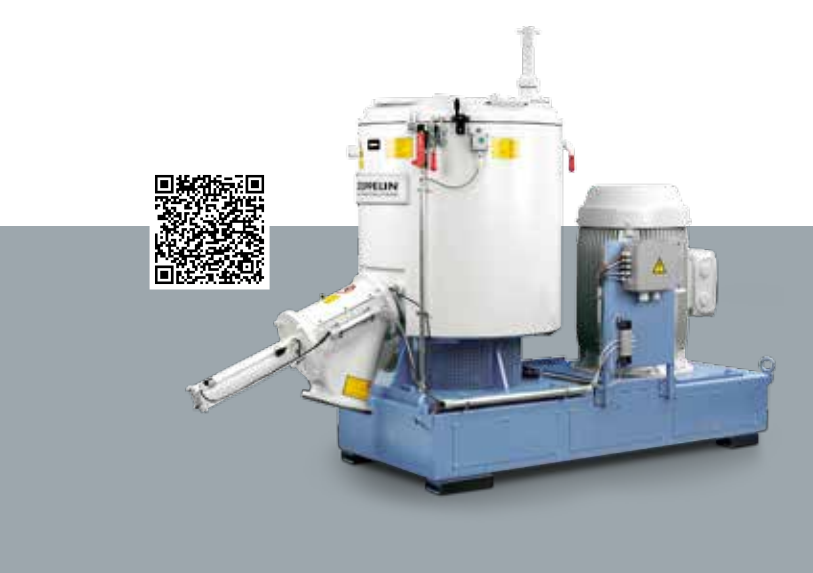
To the digital datasheet