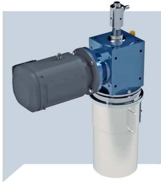
The DymoMix®: A perfect dough thanks to special hydration

The CODOS® tower consists of a reservoir, a differential weigh feeder located below it, and a liquid feeder. The first two components ensure that the powdered raw materials are continuously and consistently metered. In the bakery, this involves flour; in the starch industry, it involves starch, proteins, dextrans, etc. Together with the powdered raw materials, the liquids are also continuously metered. This is ensured by the third component of the tower - liquid dosing for tempered water, yeast suspension, salt solution or similar. The aggregates and instruments are summarized on the liquid panels on the CODOS® tower. The panels are also modular and can be easily replaced thanks to their easy accessibility on the tower.