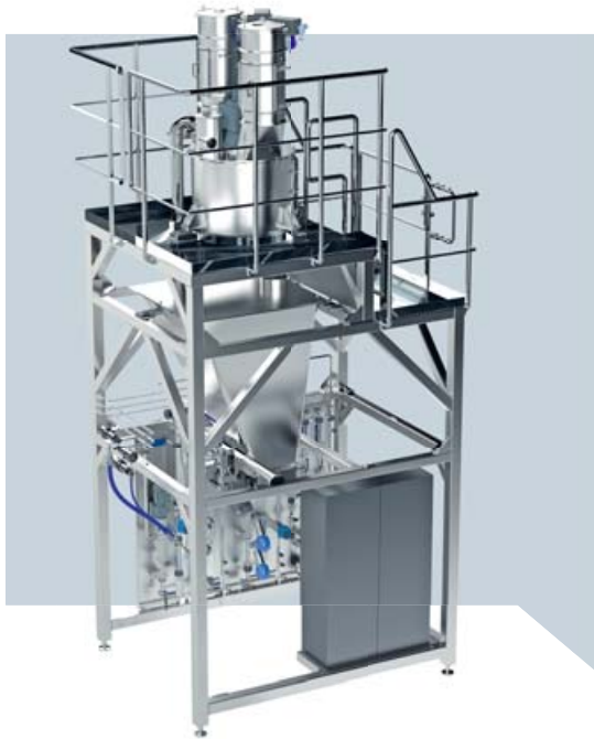
The CODOS® Tower: Doses liquids and solids

The CODOS® NT works most effectively in a network. The complete system consists of a CODOS® tower, a DymoMix® mixer and a CODOS® NT kneader.