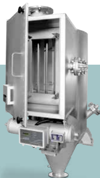
Dust collector with two-step filtration