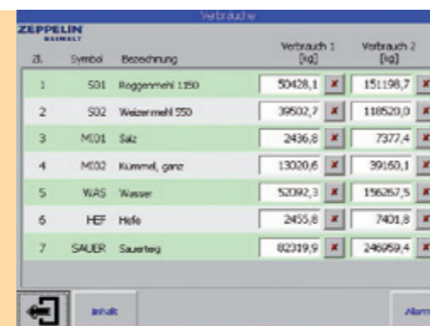
Monthly and quarterly consumptions