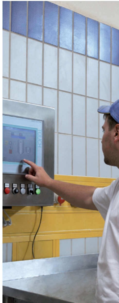
MINT 99 in action

Zeppelin Reimelt offers a range of customized control systems for the bakery trade, medium-sized business and the industry from mere scaling up to fully automatic production systems based on web technology. The individual systems can be retrofitted and upgraded at any time and combined with each other to suit the requirements of your individual production processes. Furthermore, you will benefit from a high degree of investment security as our team guarantees software maintenance for many years.