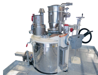
More than just PVC