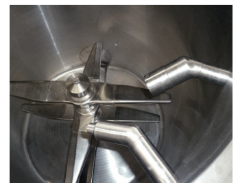
Integrated addition of liquids