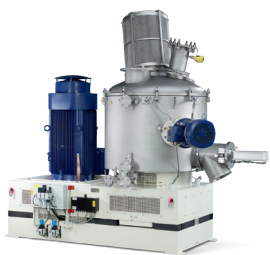
For hot-melt granulation