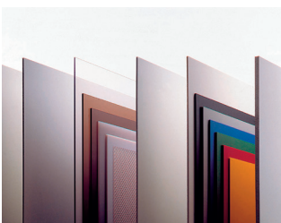
Rigid and soft PVC

MTI Flex®-line – meeting any challenge Versatility in use: